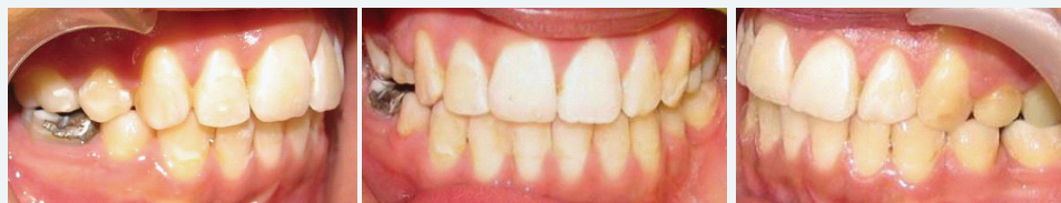
Figure 5: Posttreatment intraoral photographs.