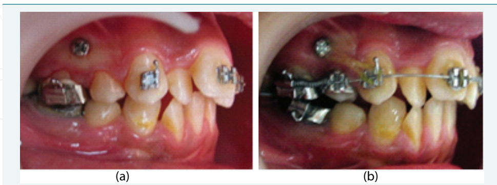
Figure 3: (a) Placement of the mini-implant between the second premolar and first upper molar. (b) Distalization of the posterior teeth by indirect anchorage.