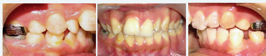
Figure 2: Initial intraoral photographs.