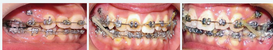
Figure 4: Intraoral photographs of mid treatment during molar distalization.