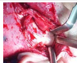
Figure 3: Incision showing the TMJ and the newly formatted bone causing the ankylosis.