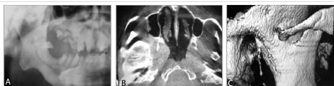
Figure 2: Radiographic examination of the patient. A: Panoramic X-ray B: CT-scan C: 3D-reconstruction image.