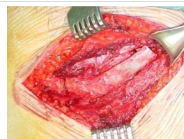
Figure 4: Costo-chondral graft from the 6 th rib.