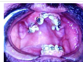
Figure 6: Mouth opening immediate after surgery.