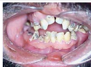
Figure 1: Limited opening of the mouth and the V-shaped formation of the maxilla.

temporal fascia sutured in the region replacing the articular disc and preventing new ankylosis. The function of the joint was tested and the maximum mouth opening showed nearly 40 mm (Figure 6).